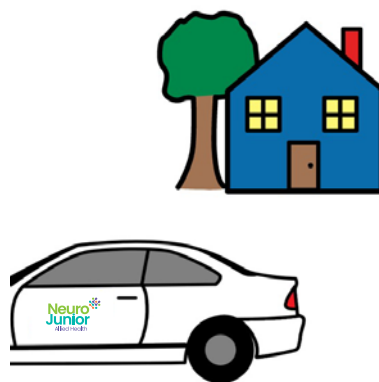
therapist will leave