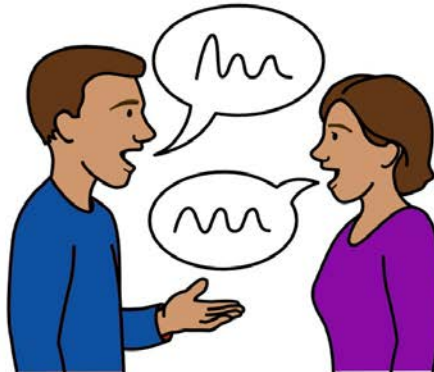
my therapist talks to mum/dad