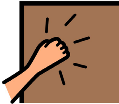
my therapist knocks on the door