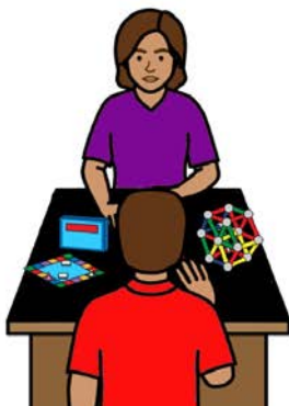
do interactive activities