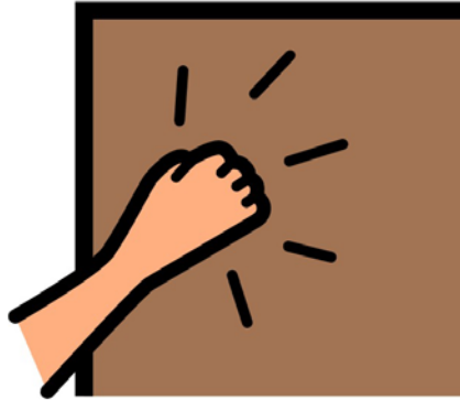
my therapist knocks on the door