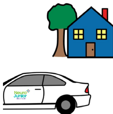
therapist will leave