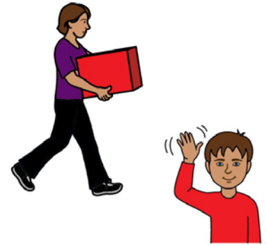
my therapist brings equipment