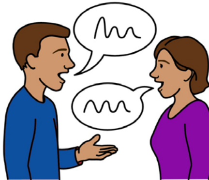
my therapist talks to mum/dad