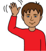
therapist calls my name