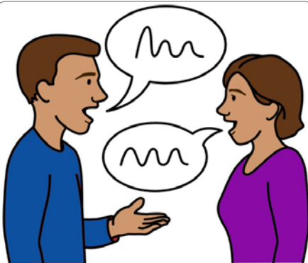
therapist talks to mum/dad