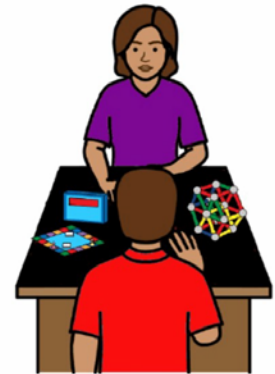
do interactive activities