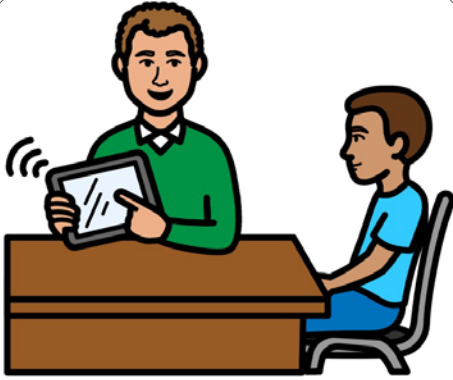
I'm going to see my therapist