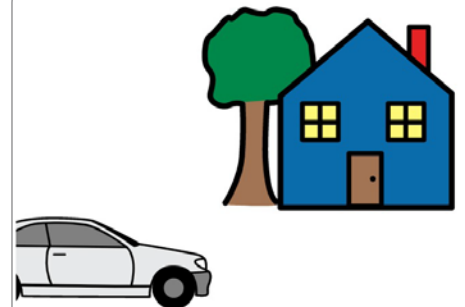
time to go